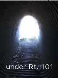
under Rt. 101

Mile 0.66 - Trail users cross under Rt. 101 in a tunnel 110' long and 6'6" high. This 'tunnel' is actually an over-flow culvert protecting the state highway from the possible flooding of Great Brook.